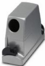
HEAVYCON ADVANCE standard powder-coated sleeve housing B24, with bayonet locking, height 100 mm, with 1xM40 thread, lateral cable outlet

Please be informed that the data shown in this PDF Document is generated from our Online Catalog. Please find the complete data in the user's documentation. Our General Terms of Use for Downloads are valid ( http://phoenixcontact.com/download )