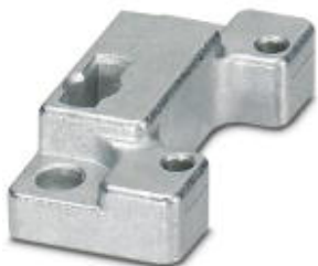
Panel mounting flange for HEAVYCON ADVANCE TMB housing with bayonet locking

Please be informed that the data shown in this PDF Document is generated from our Online Catalog. Please find the complete data in the user's documentation. Our General Terms of Use for Downloads are valid ( http://phoenixcontact.com/download )