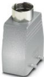
HEAVYCON sleeve housing B10, for double locking latch, height 72 mm, with support 1x M25, straight conductor exit

Please be informed that the data shown in this PDF Document is generated from our Online Catalog. Please find the complete data in the user's documentation. Our General Terms of Use for Downloads are valid ( http://phoenixcontact.com/download )