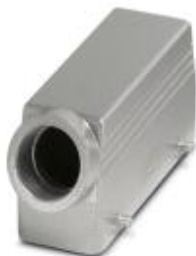
HEAVYCON sleeve housing B16, for double locking latch, height 60 mm, with support 1x M25, lateral conductor exit

Please be informed that the data shown in this PDF Document is generated from our Online Catalog. Please find the complete data in the user's documentation. Our General Terms of Use for Downloads are valid ( http://phoenixcontact.com/download )