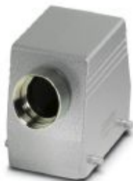
HEAVYCON sleeve housing D50, for double locking latch, height 76 mm, with support 1x M32, lateral conductor exit

Please be informed that the data shown in this PDF Document is generated from our Online Catalog. Please find the complete data in the user's documentation. Our General Terms of Use for Downloads are valid ( http://phoenixcontact.com/download )