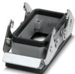
HEAVYCON B10; with double locking latch made of sheet steel (not divided); height 27 mm, with flat gasket

Please be informed that the data shown in this PDF Document is generated from our Online Catalog. Please find the complete data in the user's documentation. Our General Terms of Use for Downloads are valid ( http://phoenixcontact.com/download )