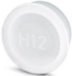
Plastic protection cap for connectors with M40 external thread

Please be informed that the data shown in this PDF Document is generated from our Online Catalog. Please find the complete data in the user's documentation. Our General Terms of Use for Downloads are valid ( http://phoenixcontact.com/download )