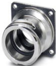
Panel mounting base, straight, Bayonet locking, M23, Flat gasket, 4xM3, shielded: yes, panel thickness max.: 2.5 mm

Please be informed that the data shown in this PDF Document is generated from our Online Catalog. Please find the complete data in the user's documentation. Our General Terms of Use for Downloads are valid ( http://phoenixcontact.com/download )