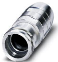
Sleeve housing for coupler connector, straight, Bayonet locking, M23, shielded: yes, cable diameter range: 2 mm ... 14.5 mm

Please be informed that the data shown in this PDF Document is generated from our Online Catalog. Please find the complete data in the user's documentation. Our General Terms of Use for Downloads are valid ( http://phoenixcontact.com/download )