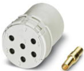
Contact insert, number of positions: 6, type of contact: Socket, Crimp connection

Please be informed that the data shown in this PDF Document is generated from our Online Catalog. Please find the complete data in the user's documentation. Our General Terms of Use for Downloads are valid ( http://phoenixcontact.com/download )