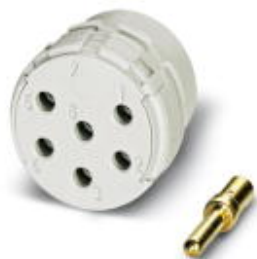
Contact insert, number of positions: 7, type of contact: Pin, Crimp connection

Please be informed that the data shown in this PDF Document is generated from our Online Catalog. Please find the complete data in the user's documentation. Our General Terms of Use for Downloads are valid ( http://phoenixcontact.com/download )