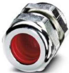
Cable gland, shielded: yes, cable diameter range: 9 mm ... 13 mm

Please be informed that the data shown in this PDF Document is generated from our Online Catalog. Please find the complete data in the user's documentation. Our General Terms of Use for Downloads are valid ( http://phoenixcontact.com/download )