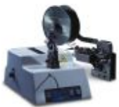
Electrical crimp device for punched-rolled C-HC crimp contacts

Electrical crimping tool - SF-Z0032 - 1607462