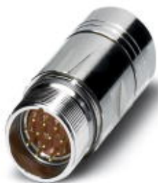
Coupler connector, straight, Screw locking, M23, number of positions: 17, type of contact: Pin, Crimp connection, shielded: yes, cable diameter range: 5 mm ... 13.2 mm

Please be informed that the data shown in this PDF Document is generated from our Online Catalog. Please find the complete data in the user's documentation. Our General Terms of Use for Downloads are valid ( http://phoenixcontact.com/download )