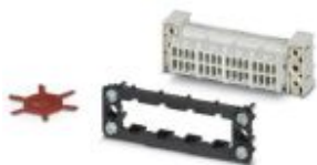
The figure shows the 32-pos. version

Contact insert set for mounting side, sleeve frame with PE, 4 fixing screws, 8-pos. contact inserts preassembled, 6 coding profiles, 2 mounting flanges