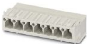
The figure shows the product version VC-AML 7

Contact insert, Contact insert, type: VC4, number of positions: 7, Type of contact: Pin. Connectors may only be connected/disconnected when under no load.