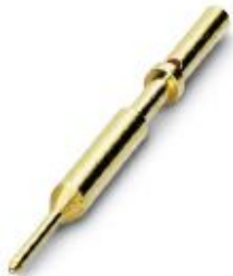
Crimp contact, turned, contact diameter: 0.6 mm, crimp range: 0.06 mm 2 ... 0.25 mm 2

Please be informed that the data shown in this PDF Document is generated from our Online Catalog. Please find the complete data in the user's documentation. Our General Terms of Use for Downloads are valid ( http://phoenixcontact.com/download )