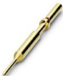
Crimp contact, turned, contact diameter: 0.6 mm, crimp range: 0.14 mm 2 ... 0.34 mm 2

Please be informed that the data shown in this PDF Document is generated from our Online Catalog. Please find the complete data in the user's documentation. Our General Terms of Use for Downloads are valid ( http://phoenixcontact.com/download )