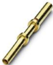
Crimp contact, turned, contact diameter: 0.6 mm, crimp range: 0.06 mm 2 ... 0.25 mm 2

Please be informed that the data shown in this PDF Document is generated from our Online Catalog. Please find the complete data in the user's documentation. Our General Terms of Use for Downloads are valid ( http://phoenixcontact.com/download )