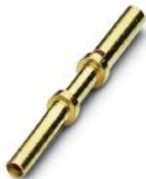
Crimp contact, turned, contact diameter: 0.6 mm, crimp range: 0.14 mm 2 ... 0.34 mm 2

Please be informed that the data shown in this PDF Document is generated from our Online Catalog. Please find the complete data in the user's documentation. Our General Terms of Use for Downloads are valid ( http://phoenixcontact.com/download )