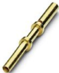
Crimp contact, turned, contact diameter: 0.6 mm, crimp range: 0.34 mm 2 ... 0.5 mm 2

Please be informed that the data shown in this PDF Document is generated from our Online Catalog. Please find the complete data in the user's documentation. Our General Terms of Use for Downloads are valid ( http://phoenixcontact.com/download )