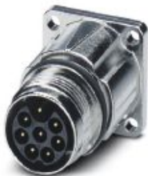
The figure shows the 8-pos. (7+PE) product version

Please be informed that the data shown in this PDF Document is generated from our Online Catalog. Please find the complete data in the user's documentation. Our General Terms of Use for Downloads are valid ( http://phoenixcontact.com/download )