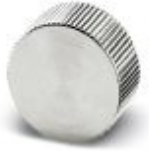
Metal protection cap for connectors with M17 external thread

Metal protective cap - ST-Z0014 - 1616069