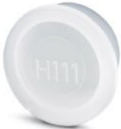
Plastic protection cap for connectors with M17 knurled nut and M17 SPEEDCON knurled nut

Please be informed that the data shown in this PDF Document is generated from our Online Catalog. Please find the complete data in the user's documentation. Our General Terms of Use for Downloads are valid ( http://phoenixcontact.com/download )