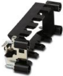
Replacement screws for sleeve frame

Please be informed that the data shown in this PDF Document is generated from our Online Catalog. Please find the complete data in the user's documentation. Our General Terms of Use for Downloads are valid ( http://phoenixcontact.com/download )