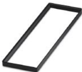
Replacement seal for size 2 sleeve

Please be informed that the data shown in this PDF Document is generated from our Online Catalog. Please find the complete data in the user's documentation. Our General Terms of Use for Downloads are valid ( http://phoenixcontact.com/download )