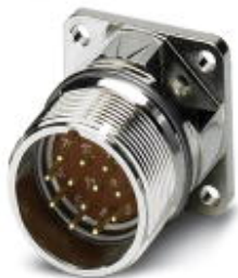
Device connector, front mounting, straight, Screw locking, M23, number of positions: 17, type of contact: Pin, Crimp connection, Axial O-ring, 4x Ø2,7, shielded: yes

Please be informed that the data shown in this PDF Document is generated from our Online Catalog. Please find the complete data in the user's documentation. Our General Terms of Use for Downloads are valid ( http://phoenixcontact.com/download )