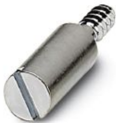
Coding pins, for sleeve housing, to prevent identical connectors from being confused

Please be informed that the data shown in this PDF Document is generated from our Online Catalog. Please find the complete data in the user's documentation. Our General Terms of Use for Downloads are valid ( http://phoenixcontact.com/download )