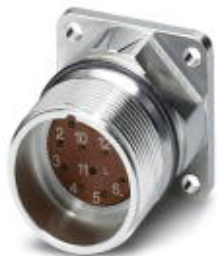
Device connector, front mounting, straight, Screw locking, M23, number of positions: 17, type of contact: Socket, Crimp connection, Axial O-ring, 4x Ø 3.2, shielded: yes

Please be informed that the data shown in this PDF Document is generated from our Online Catalog. Please find the complete data in the user's documentation. Our General Terms of Use for Downloads are valid ( http://phoenixcontact.com/download )