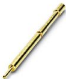
Crimp contact, turned, contact diameter: 1.6 mm, crimp range: 0.75 mm 2 ... 1.5 mm 2

Please be informed that the data shown in this PDF Document is generated from our Online Catalog. Please find the complete data in the user's documentation. Our General Terms of Use for Downloads are valid ( http://phoenixcontact.com/download )