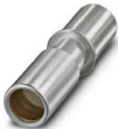
Crimp contact, turned, contact diameter: 10 mm, crimp range: 25 mm 2 ... 25 mm 2

Please be informed that the data shown in this PDF Document is generated from our Online Catalog. Please find the complete data in the user's documentation. Our General Terms of Use for Downloads are valid ( http://phoenixcontact.com/download )