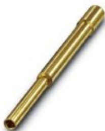
Crimp contact, turned, contact diameter: 1.6 mm, crimp range: 0.75 mm 2 ... 1.5 mm 2

Please be informed that the data shown in this PDF Document is generated from our Online Catalog. Please find the complete data in the user's documentation. Our General Terms of Use for Downloads are valid ( http://phoenixcontact.com/download )