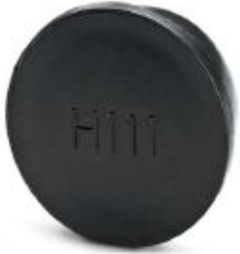
Plastic protection cap, antistatic, for connectors with M23 knurled nut

Please be informed that the data shown in this PDF Document is generated from our Online Catalog. Please find the complete data in the user's documentation. Our General Terms of Use for Downloads are valid ( http://phoenixcontact.com/download )