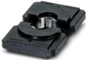
Crimping stamp for electro-hydraulic crimping device SL-Z0007 for turned crimp contacts, Ø 10 mm, SL series, crimping range 10 mm 2

Please be informed that the data shown in this PDF Document is generated from our Online Catalog. Please find the complete data in the user's documentation. Our General Terms of Use for Downloads are valid ( http://phoenixcontact.com/download )