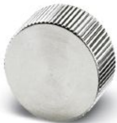
Metal protection cap for connectors with M17 external thread

Please be informed that the data shown in this PDF Document is generated from our Online Catalog. Please find the complete data in the user's documentation. Our General Terms of Use for Downloads are valid ( http://phoenixcontact.com/download )