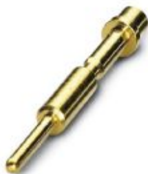
Crimp contact, turned, Single contact, contact diameter: 1 mm, crimp range: 0.34 mm 2 ... 0.5 mm 2

Please be informed that the data shown in this PDF Document is generated from our Online Catalog. Please find the complete data in the user's documentation. Our General Terms of Use for Downloads are valid ( http://phoenixcontact.com/download )