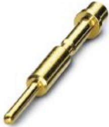
Crimp contact, turned, Single contact, contact diameter: 1 mm, crimp range: 0.5 mm 2 ... 1 mm 2

Please be informed that the data shown in this PDF Document is generated from our Online Catalog. Please find the complete data in the user's documentation. Our General Terms of Use for Downloads are valid ( http://phoenixcontact.com/download )