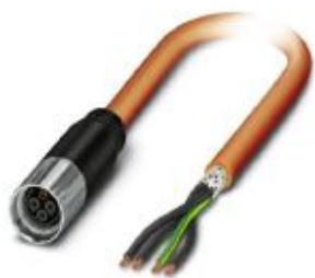
Cable plug in molded plastic, length: 2 m, color of outer sheath: orange RAL 2003

Please be informed that the data shown in this PDF Document is generated from our Online Catalog. Please find the complete data in the user's documentation. Our General Terms of Use for Downloads are valid ( http://phoenixcontact.com/download )