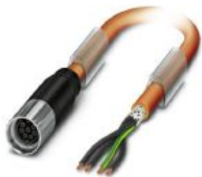
Cable plug in molded plastic, length: 5 m, color of outer sheath: orange RAL 2003

Please be informed that the data shown in this PDF Document is generated from our Online Catalog. Please find the complete data in the user's documentation. Our General Terms of Use for Downloads are valid ( http://phoenixcontact.com/download )