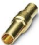
Crimp contact, turned, Single contact, contact diameter: 1 mm, crimp range: 0.14 mm 2 ... 0.56 mm 2