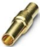
Crimp contact, turned, Single contact, contact diameter: 1 mm, crimp range: 0.08 mm 2 ... 0.22 mm 2