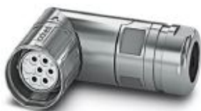
The figure shows the 6-pos. product version

Cable connector, CA, angled, shielded: yes, SPEEDCON locking, M23, No. of pos.: 7, type of contact: Socket, Solder connection, cable diameter range: 6 mm ... 10 mm