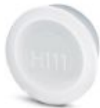
Plastic protection cap for connectors with M23 knurled nut

Plastic anti-static dust protection cap - RC-Z2468 - 1611796