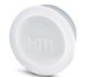
Plastic protection cap for connectors with M23 knurled nut