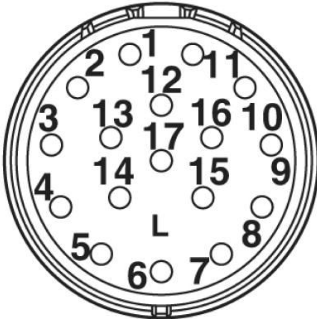
Contact chamber numbering (view of plug-in side), standard socket