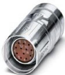
Cable connector, CA, straight, shielded: yes, SPEEDCON locking, M23, No. of pos.: 17, type of contact: Socket, Crimp connection, cable diameter range: 6 mm ... 10 mm

Please be informed that the data shown in this PDF Document is generated from our Online Catalog. Please find the complete data in the user's documentation. Our General Terms of Use for Downloads are valid ( http://phoenixcontact.com/download )