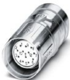
Cable connector, CA, straight, shielded: yes, SPEEDCON locking, M23, No. of pos.: 17, type of contact: Socket, Crimp connection, cable diameter range: 10 mm ... 14.5 mm

Please be informed that the data shown in this PDF Document is generated from our Online Catalog. Please find the complete data in the user's documentation. Our General Terms of Use for Downloads are valid ( http://phoenixcontact.com/download )