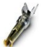
Crimp contact, rolled, Single contact, contact diameter: 1 mm, crimp range: 0.22 mm 2 ... 0.56 mm 2