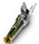
Crimp contact, rolled, Single contact, contact diameter: 1 mm, crimp range: 0.22 mm 2 ... 0.56 mm 2