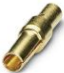
Crimp contact, turned, Single contact, contact diameter: 1 mm, crimp range: 0.5 mm 2 ... 1 mm 2