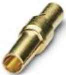
Crimp contact, turned, Single contact, contact diameter: 1 mm, crimp range: 0.08 mm 2 ... 0.22 mm 2