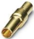
Crimp contact, turned, Single contact, contact diameter: 1 mm, crimp range: 0.14 mm 2 ... 0.56 mm 2