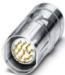
Cable connector, CA, straight, shielded: yes, SPEEDCON locking, M23, No. of pos.: 16+3, type of contact: Pin, Solder connection, cable diameter range: 4 mm ... 6 mm

Please be informed that the data shown in this PDF Document is generated from our Online Catalog. Please find the complete data in the user's documentation. Our General Terms of Use for Downloads are valid ( http://phoenixcontact.com/download )