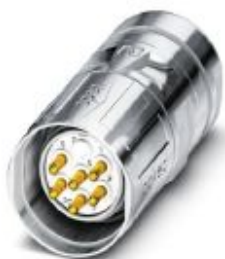
Cable connector, CA, straight, shielded: yes, SPEEDCON locking, M23, No. of pos.: 8+1, type of contact: Pin, Crimp connection, cable diameter range: 4 mm ... 6 mm

Please be informed that the data shown in this PDF Document is generated from our Online Catalog. Please find the complete data in the user's documentation. Our General Terms of Use for Downloads are valid ( http://phoenixcontact.com/download )