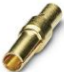
Crimp contact, turned, contact diameter: 2 mm, crimp range: 1 mm 2 ... 1.5 mm 2