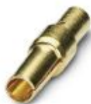
Crimp contact, turned, contact diameter: 2 mm, crimp range: 1.5 mm 2 ... 2.5 mm 2