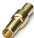
Crimp contact, turned, contact diameter: 2 mm, crimp range: 1 mm 2 ... 1.5 mm 2