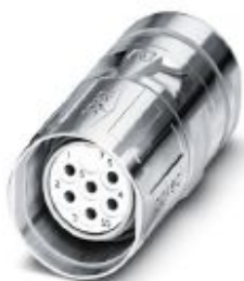
Cable connector, CA, straight, shielded: yes, SPEEDCON locking, M23, No. of pos.: 7, type of contact: Socket, Crimp connection, cable diameter range: 4 mm ... 6 mm

Please be informed that the data shown in this PDF Document is generated from our Online Catalog. Please find the complete data in the user's documentation. Our General Terms of Use for Downloads are valid ( http://phoenixcontact.com/download )