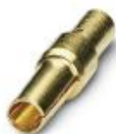
Crimp contact, turned, contact diameter: 2 mm, crimp range: 0.75 mm 2 ... 1 mm 2