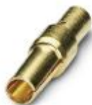
Crimp contact, turned, contact diameter: 2 mm, crimp range: 0.5 mm 2 ... 0.75 mm 2