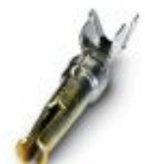
Crimp contact, rolled, Single contact, contact diameter: 1 mm, crimp range: 0.22 mm 2 ... 0.56 mm 2