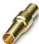
Crimp contact, turned, Single contact, contact diameter: 1 mm, crimp range: 0.08 mm 2 ... 0.22 mm 2