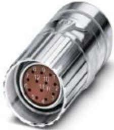
Cable connector, CA, straight, shielded: yes, Screw locking, M23, No. of pos.: 12, type of contact: Socket, Crimp connection, cable diameter range: 6 mm ... 10 mm

Please be informed that the data shown in this PDF Document is generated from our Online Catalog. Please find the complete data in the user's documentation. Our General Terms of Use for Downloads are valid ( http://phoenixcontact.com/download )